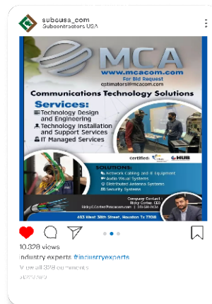
Social Media Posts

5. Enhanced Reputation: Being listed in a reputable online directory can enhance your business' credibility and reputation.