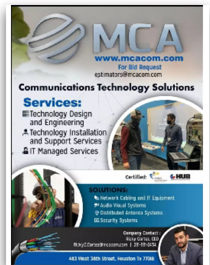
Eblasts | Quarter Page Ad