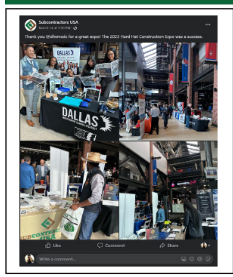
Social Post $150 each