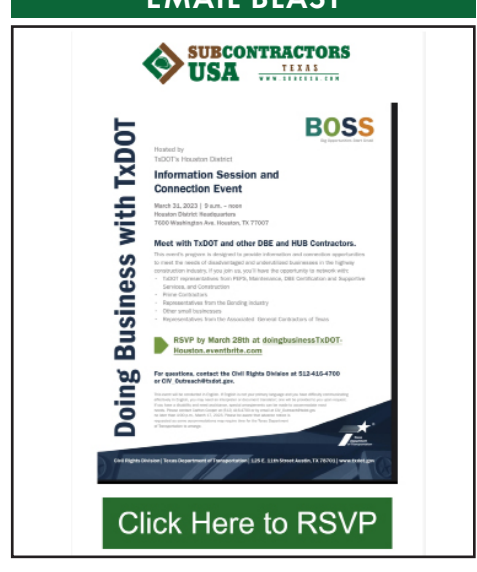
Eblast $375 each