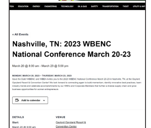
Calendar Post $150 each